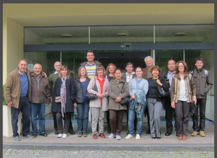
Picture (above): Participants of the training course in front of the Hotel "Plitvice".