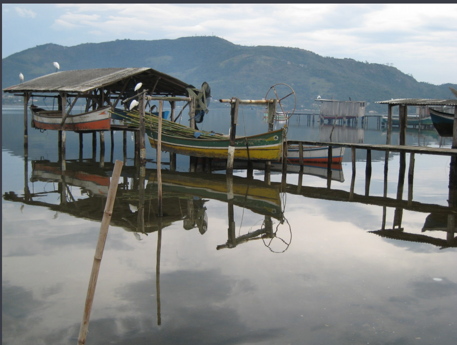
Picture: Lagoa Santo Antônio, Brazil