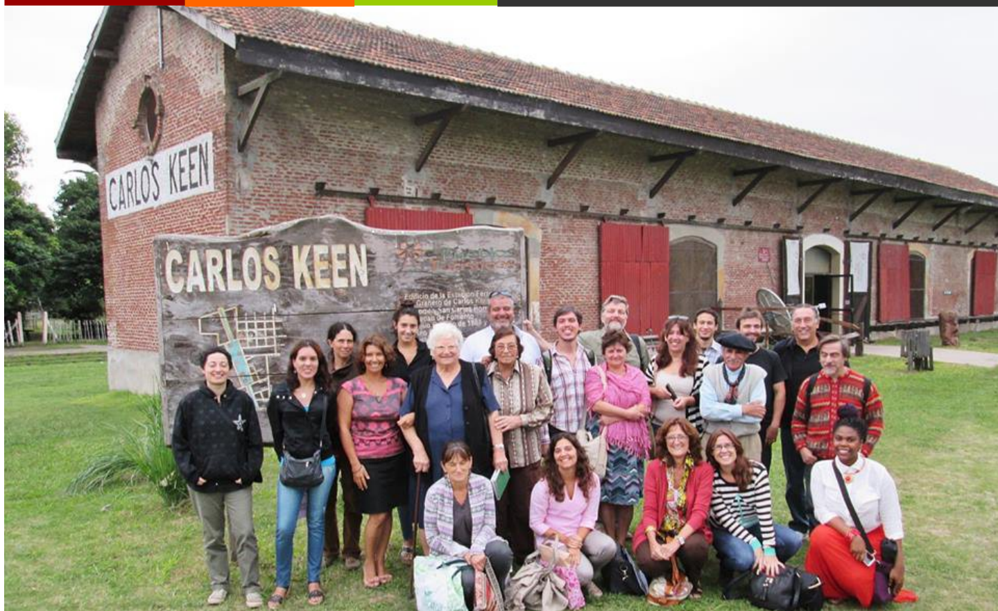
Picture: UNLU and UT partners with members of the community during the Open Day at Carlos Keen, Argentina