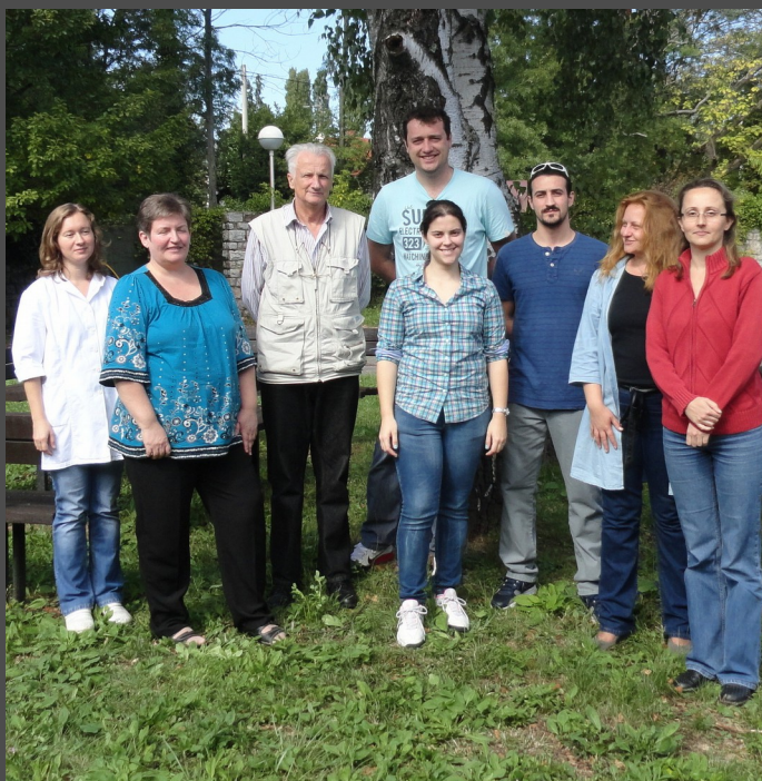
Picture: Brazilian and Croatian Teams at the RBI courtyard.