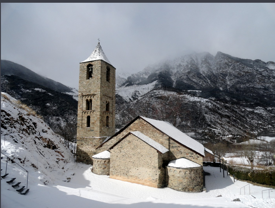
Picture: Boi Valley, one example of a romanesque church