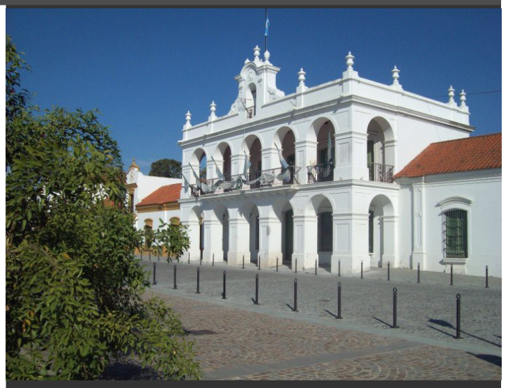
Facade of the historic colonial town council, today Historical Museum Complex "Enrique Udaondo", Luján, Argentina

MEXICO: Cuitzeo Lake (Volcanic and Monumental area). Tourism is an effective magnet for Morelia Heritage (State of Michoacán) whose effects can, or come up to the Cuitzeo Lake area, with potential unexploited touristic and monumental resources. The government of Michoacán is developing a policy to foster tourism together with municipal governments and businessmen in the sector, and this has resulted in substantive growth in touristic indicators during the period 2002-2007. Morelia is an outstanding example of urban planning which combines the ideas of the Spanish Renaissance with the Mesoamerican experience. In its declaration, UNESCO (1991) recognized that the urban landscape of Morelia is unique in the Americas.