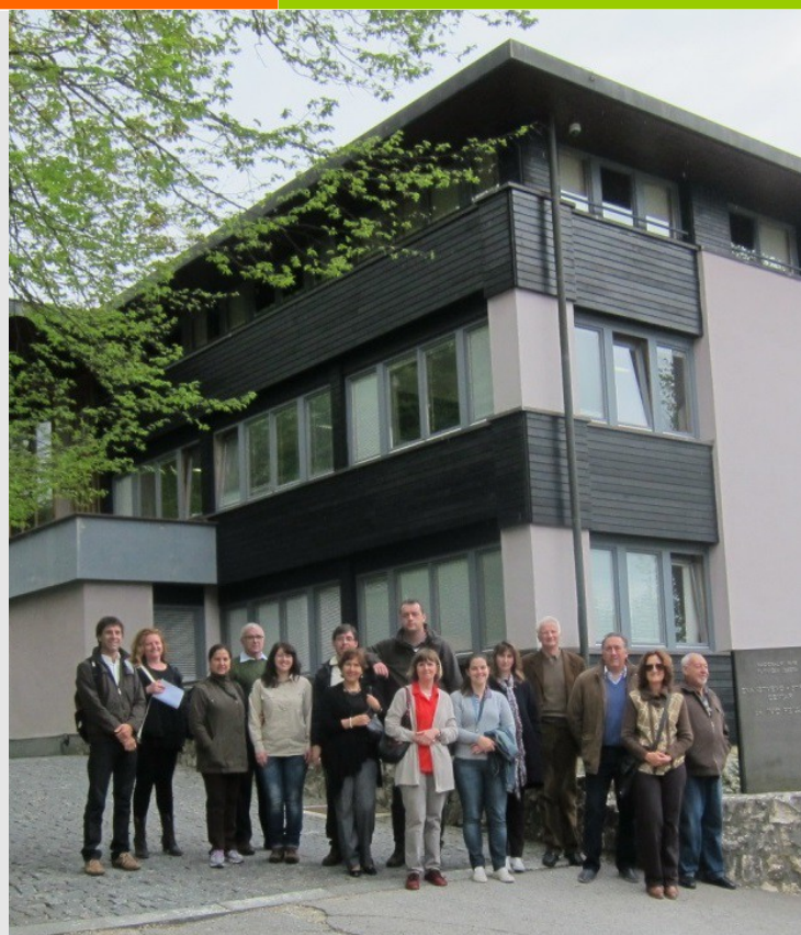
Picture (above): STRAVAL Team in front of the Scientific Research Centre "Ivo Pevalek", Croatia