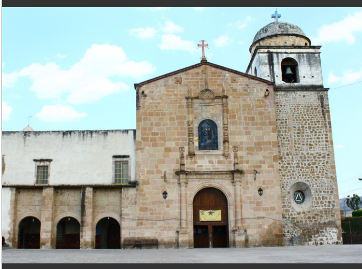
Temple, pilgrims portal and cloister from the former Augustinian convent of Copándaro de Galeana, Michoacán, Mexico

ARGENTINA: Surrounding Luján area (Religious pole of attraction). In the same way, we can mention the cultural and socio-economic impact taking place in the surroundings of the city of Luján, since the Basilica "Nuestra Señora de Luján" and Enrique Udaondo Museographic Complex have been declared a historical heritage of the Argentine Republic. Lujan received annually between 5 and 6 million pilgrims, is the largest centre of religious tourism in South America. Carlos Keen town, only 13km from Luján has grown with numerous socio-economic, environmental and geo-political issues, represented by the ambition for land and green spaces, disordered structures, lack of services in accord to the new geographical dimensions, the accumulation of garbage at times of high flow of visitors, among others.