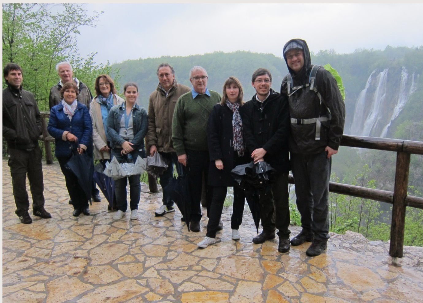
Picture: Participants of Training Course during the field trip at the lookout towards the Large Waterfall (72 m)