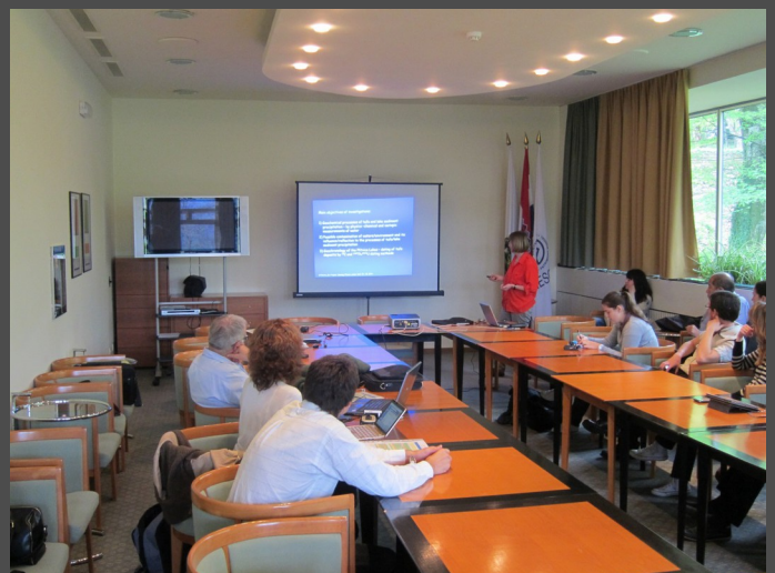
Pictures (below): Participants during the lectures in the lecture room of hotel "Plitvice".