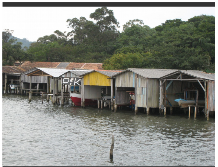
Artisanal dock in Santo Antônio lagoon, Brazil

The Protected Area object is to protect and to harmonize human activities beings with the presence of the whales, to promote the sustainable development and to control the tourism activities linked to whales' observation. The APA understands 9 municipalities located in the south coast of Santa Catarina (almost 1.000.000 of inhabitants). Economy in these cities is linked to the tourism and agriculture activities, except for the cities that located in the Florianopolis (Capital of the State) area, whose activities are tied to the industrial production and services. Meanwhile an activity that occupies great part of the local labour is artisan fishes that together with the tourism are the main activities regulated by the law of creation of the Environment Protection area. The main objective in this work-area will be to analyze the effects that the legislation had caused to the most productivity economic activities like tourism, culture and fishing, and its social impacts. Recommendation for a sustainable development plan will be addressed for the main stakeholders. .